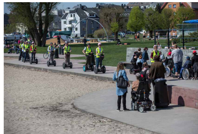
FREE WHEELING: Wheels of all kinds, including tourists on Segways, can easily spin down the beach promenade.

“We wheelchair users got to sit on the first row, so we didn't have to look into the backs of people. It was like getting VIP seats”