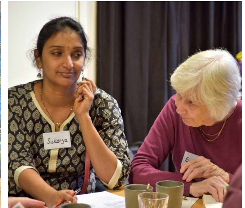
MEETING PLACE: The Citizen Square gathers the local community in Borgen.

HARRY RUNS THE BOULES , Trine offers free exercise classes for new mothers, SeniorNet gives digital courses, there are free theater classes run by the Culture School, hip hop classes set up by Arena Borgen, and a language café run by the community centre. These are only some of the different activities and services offered at Borgen Citizen Square in Asker.