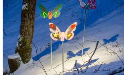
DECORATION: Light decoration designed by Olsson & Linder and Saupstad/Kolstad Youth Council, contributes to the sense of security in the Firblad Forest.