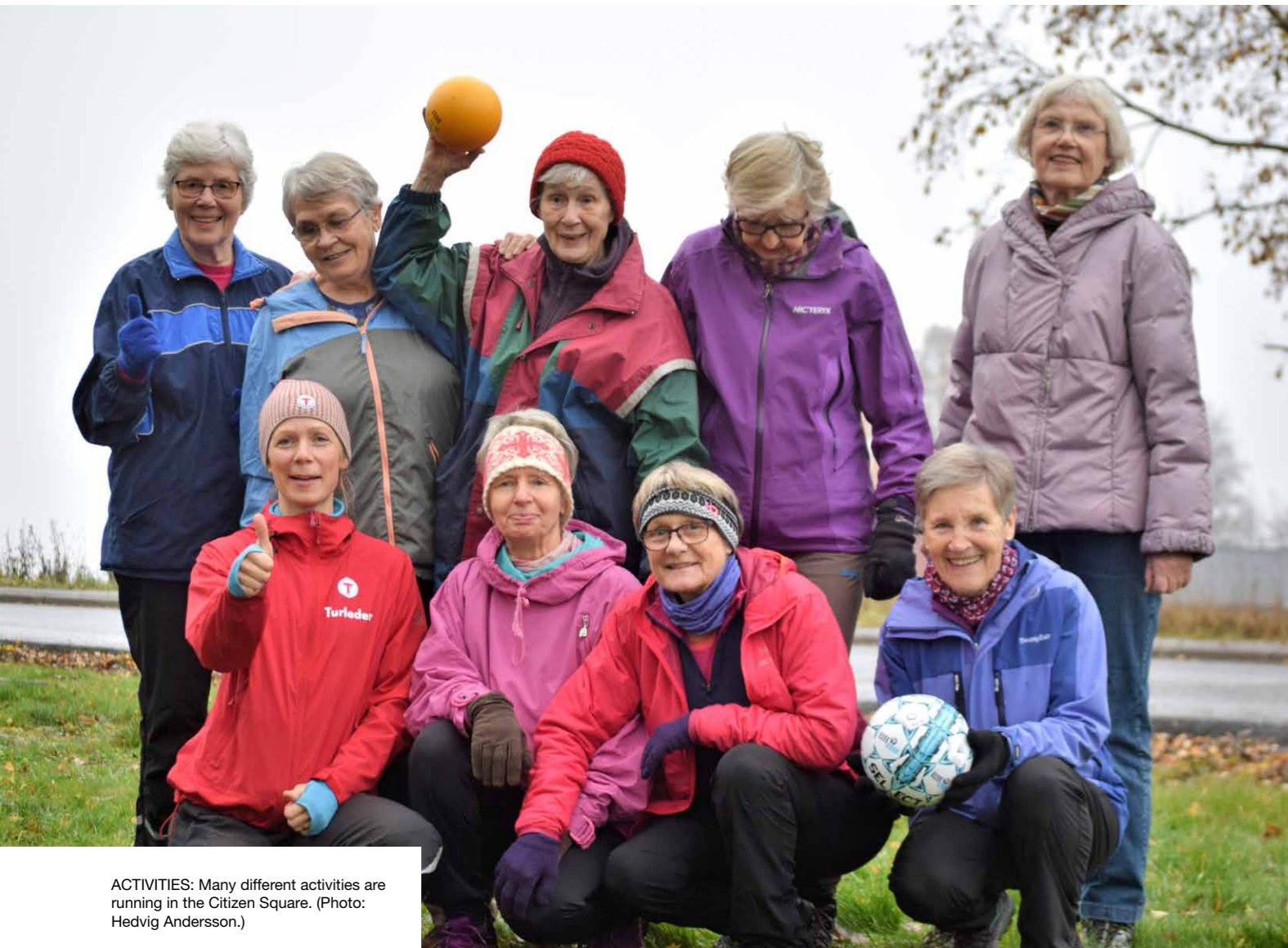
ACTIVITIES: Many different activities are running in the Citizen Square.

An active and friendly meeting place for all ages. That is the goal with the new Citizen Square in Asker. In May this year Borgen Citizen Square opened.