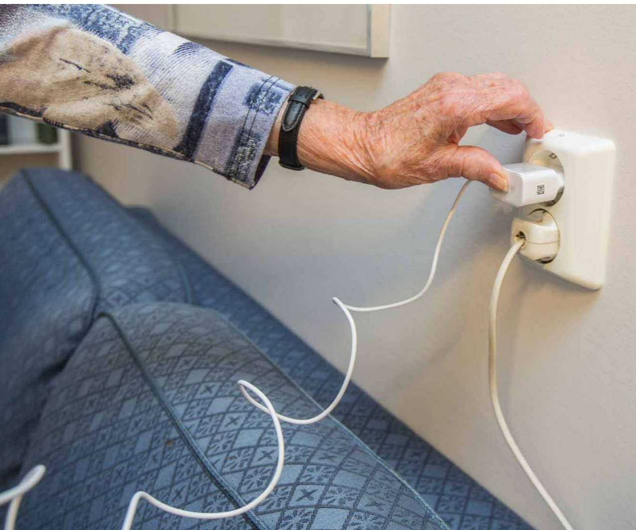
RIGHT HEIGHT: The plug sockets are mounted high up on the wall for easy reach.

around Viul's flat, once an old nursing home.