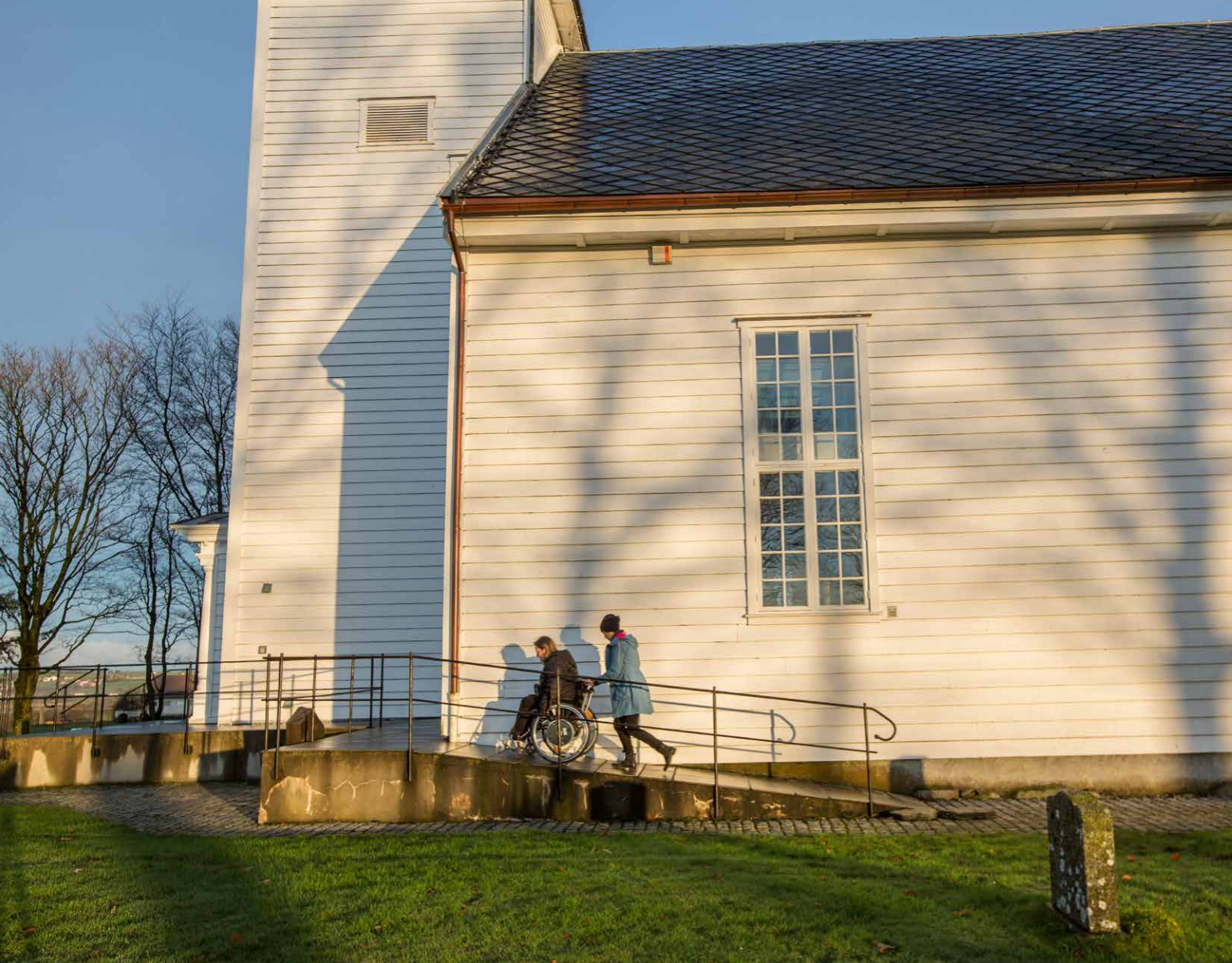
FOR EVERYONE: Now, everyone who depends on wheels can enter the church through the main entrance.