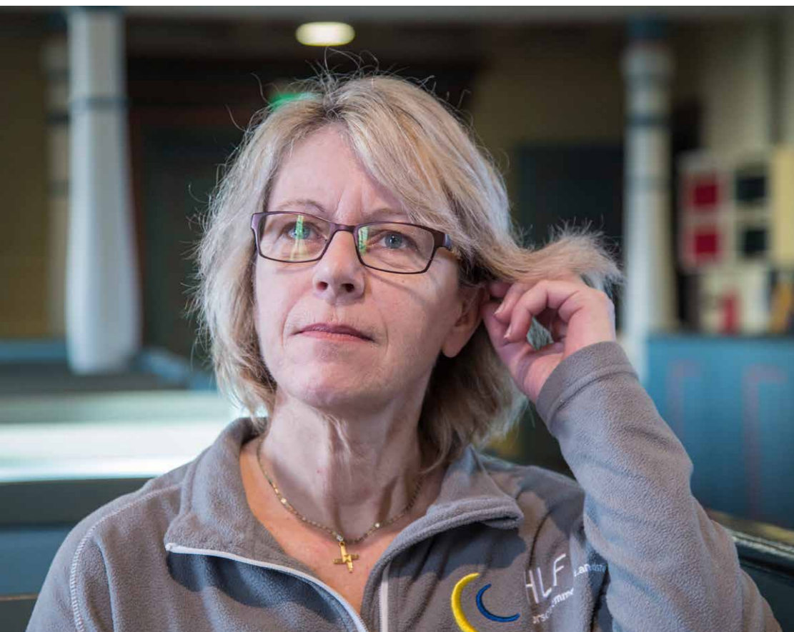
TELECOM LOOP: With a telecom loop, the hearing impaired can hear the sermony in Time Church.